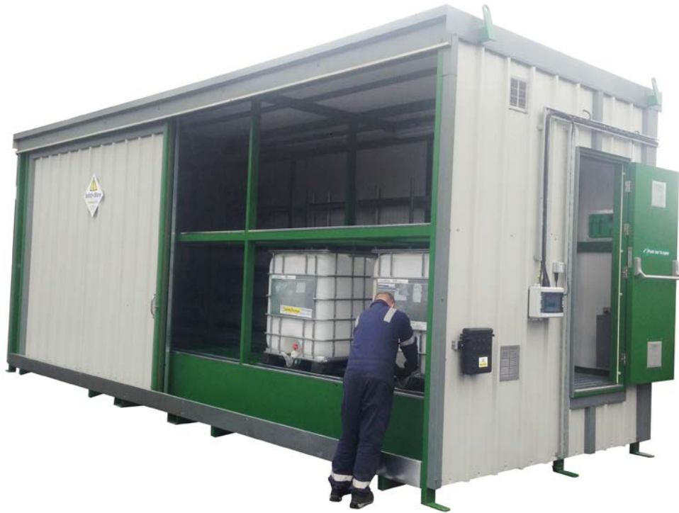
11,500 litre Bund.